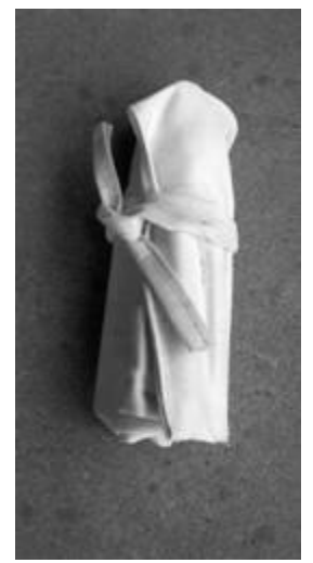
Gerald's wife Frankie made the nice roll to hold all the tools.

Slit punches- 3/8" and ½" mortises Drifts- 3/8" & ½" round; ¼" & 3/8" square Monkey tools- ¼", 3/8" & ½" round Canvas tool roll.