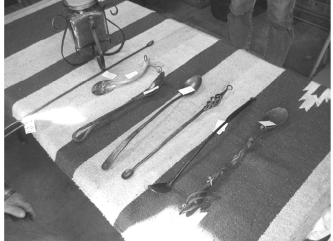
matter of fact I don't recall a single item I wouldn't be proud to have.

There were several good trade items; as a