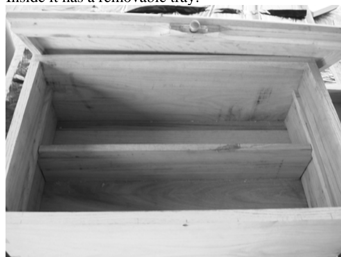
With the tray removed you can see the bottom of

the box with it center divider. These features will all tools to be kept organized.