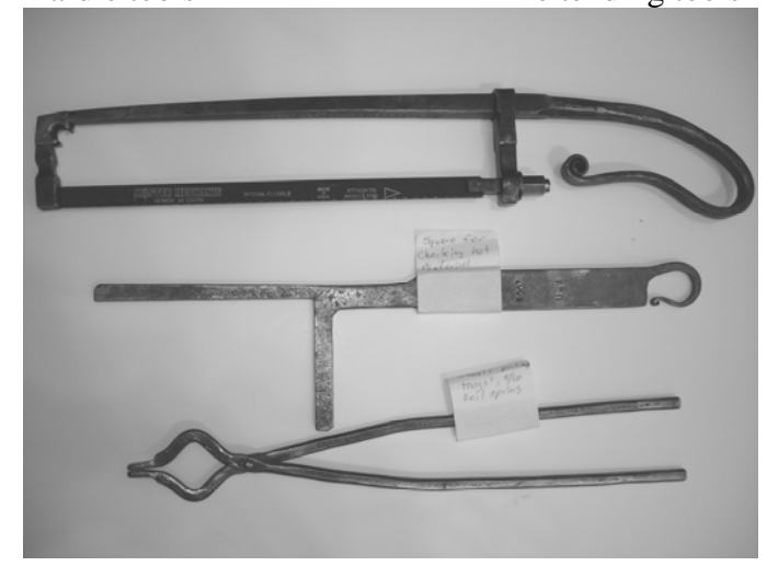
These are the tools that Maurice Hamburger sent for the toolbox.

Here is a reminder of the tools that were in last years box. Rounding hammer Bending and twisting wrenches Punches Hacksaw Wire brush Several types of tongs Hardie tools Fire tending tools