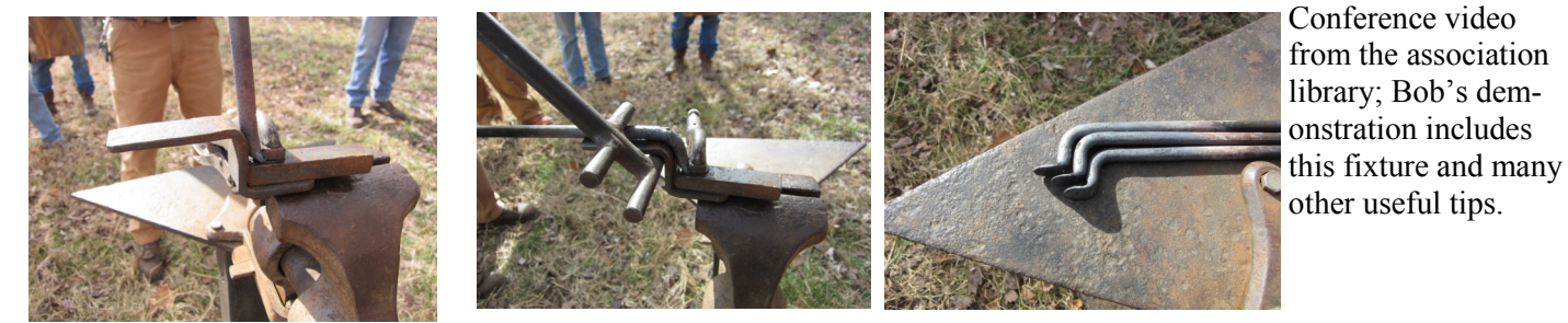
Photo Two shows the fixture in the vise and a (hot) to-be-bent leg clamped in place on the horizontal leg of the 'Z'. In Photo Three you see a bending / scrolling fork being used to bend the leg over against the fixture. A bit of truing up and alignment of the bend at the anvil may be necessary. Referring again to Photo One, you see three legs all bent to the same height above the feet. If you would like to see this fixture in use, check out the 2004 Saltfork Annual

nearly square to produce a bend with a tight inside radius (Photo Four). For bending heavier bars, it is a good idea to make the vise tab such that it will hook under one of the vise jaws as well as gripped by the both jaws. Be sure to make the lower leg of the 'Z' and the tab long enough to use all of the vise jaw width plus extra room for clamping the part to be bent; the two fixtures shown here were not made that way and they often slip in the vise.